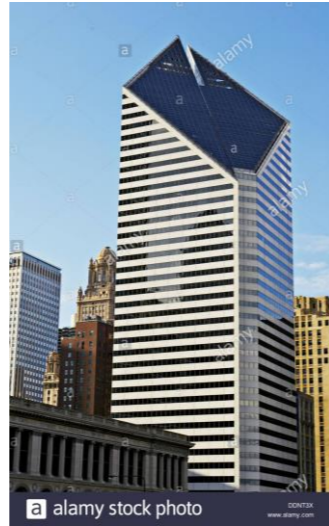
150 N. Michigan