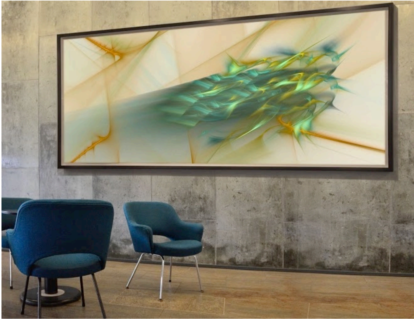
ART: RICA BELNA