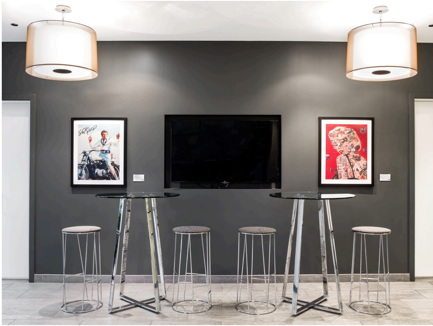
ART: KATY HIRSCHFELD