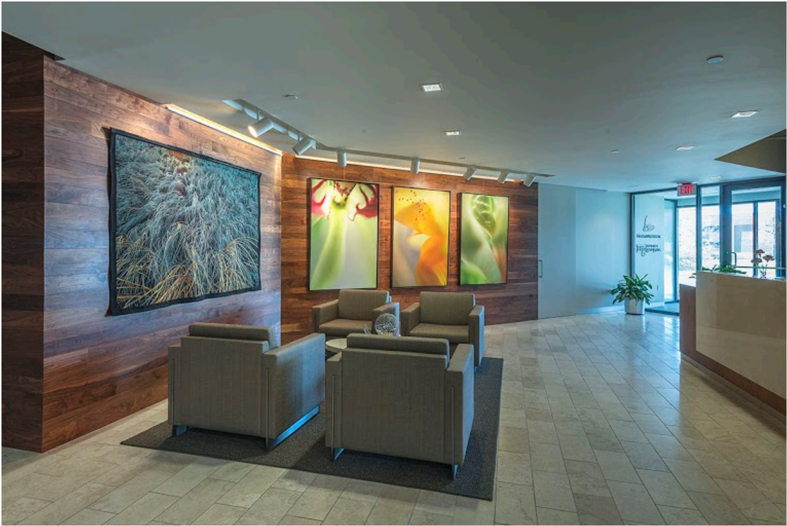
ART: TIM FORCADE