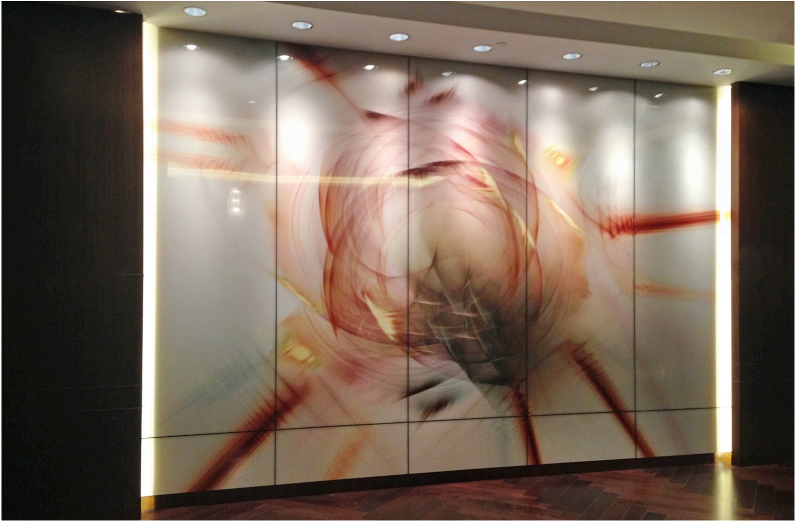
ART: RICA BELNA