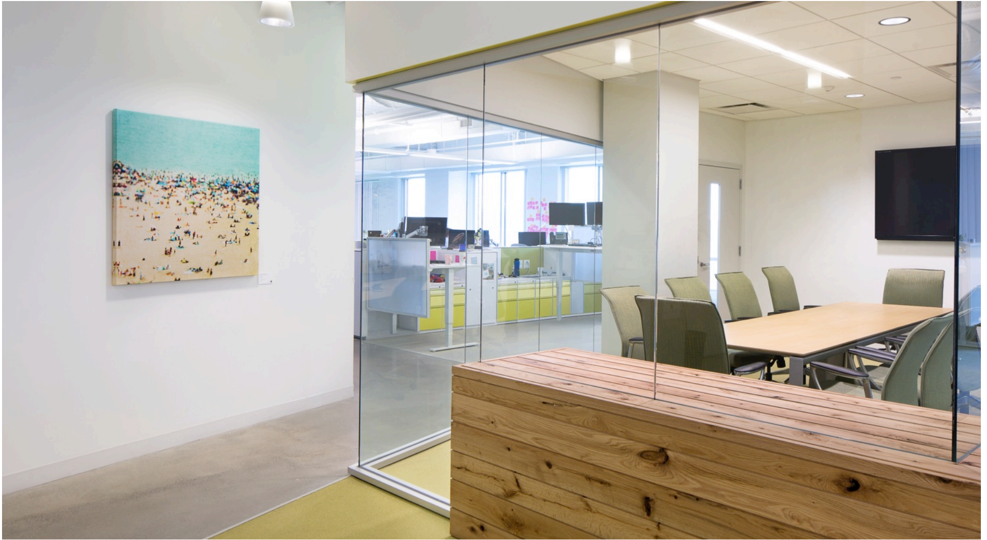
ART: ROMINA TESLARU