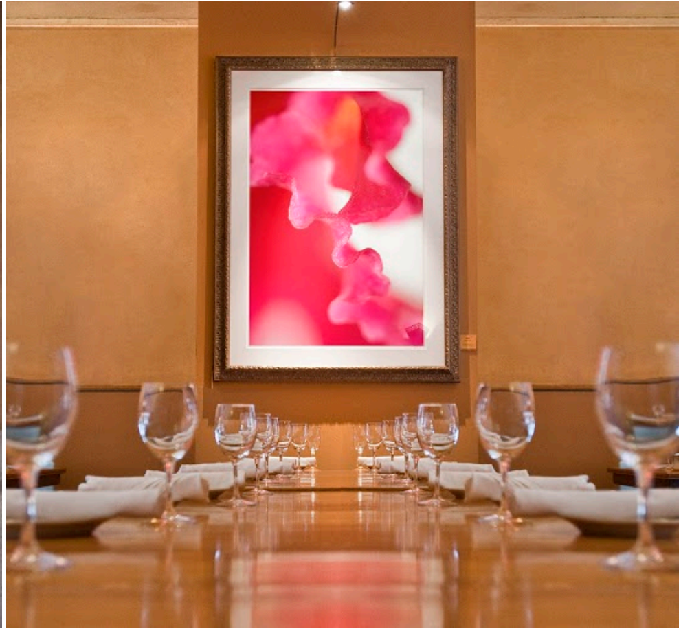
ART: TIM FORCADE