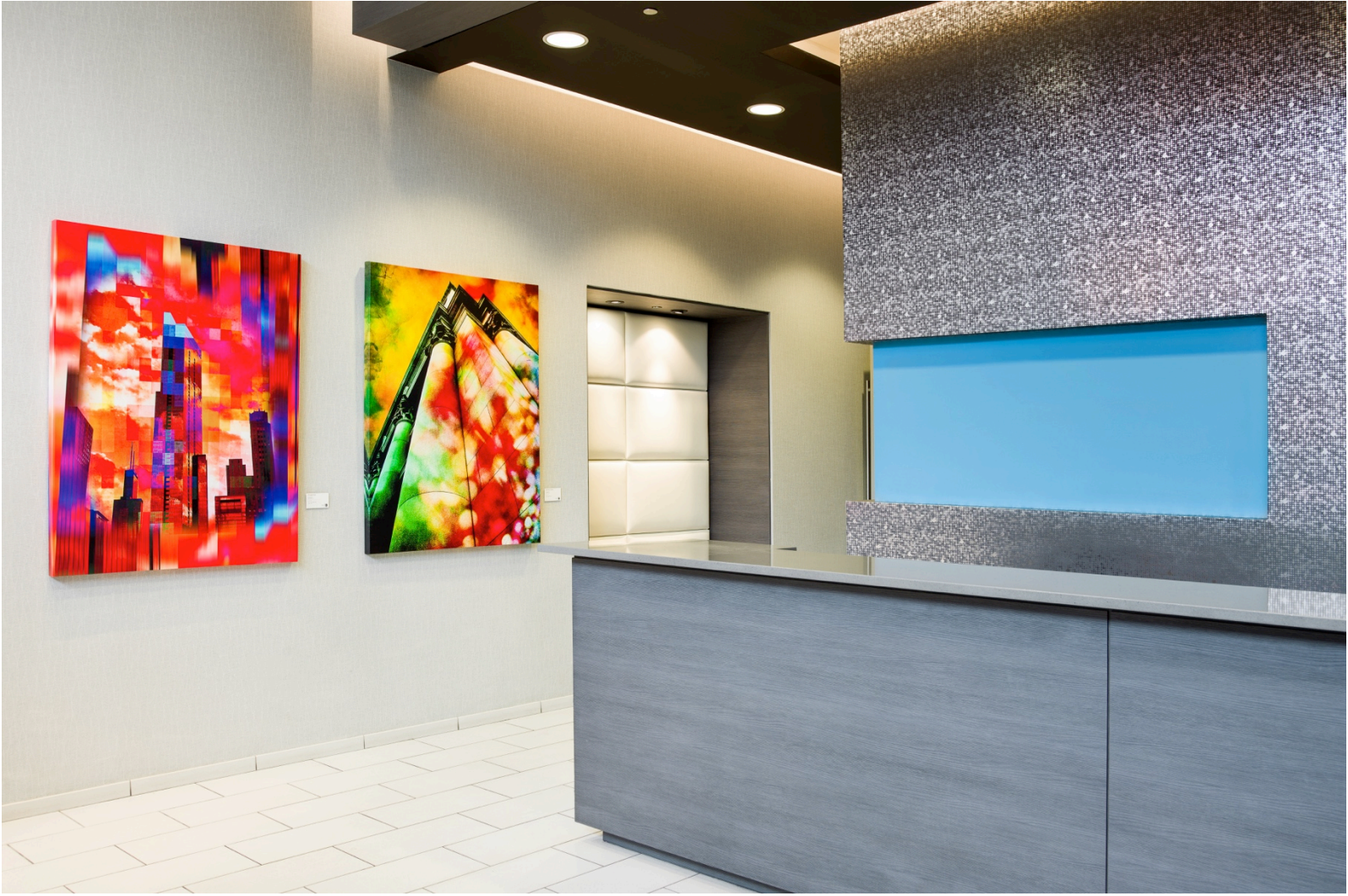
ART: ARI ROSENTHAL