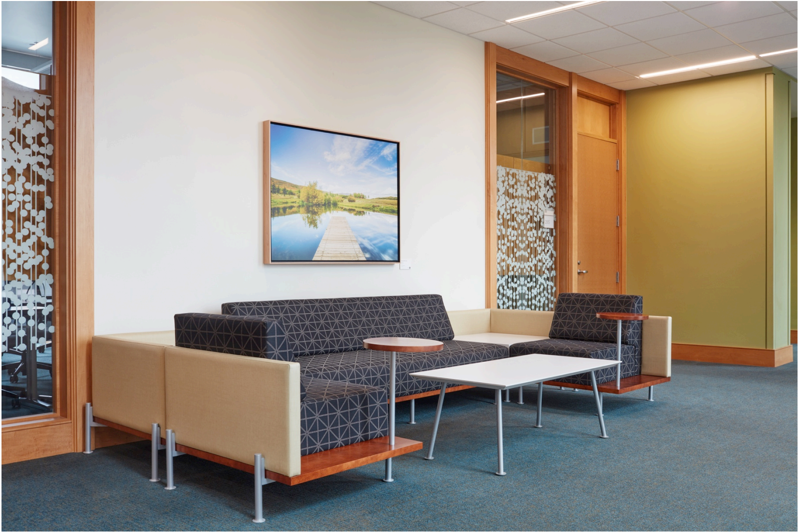
ART: CHAD WEISSER